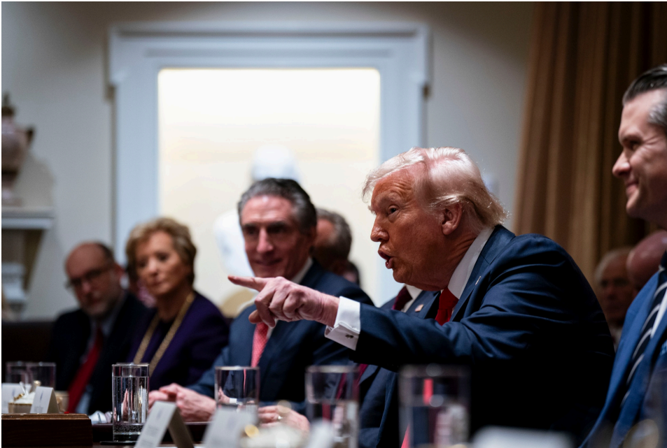
US President Donald Trump

The upheaval shows that Trump's lightening-quick campaign to slash agencies and federal workers has the potential to disrupt the lives of millions of Americans.