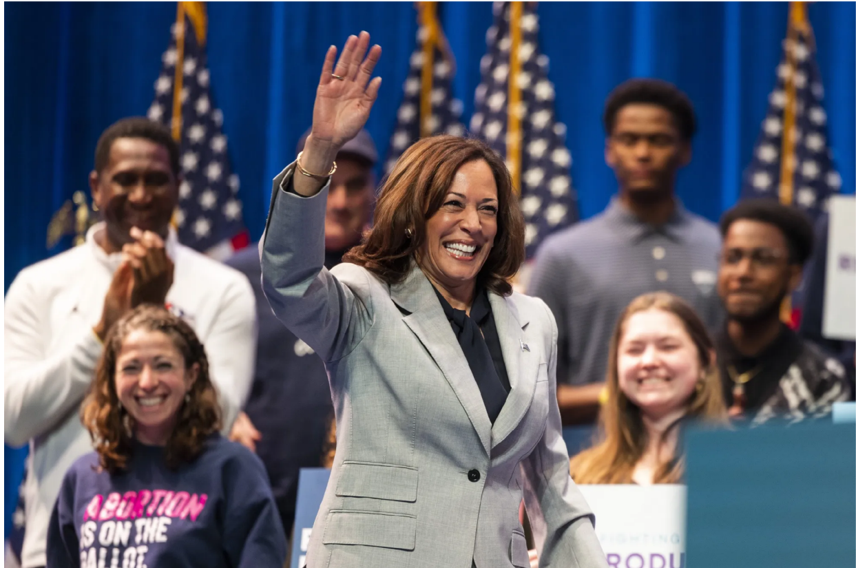
Kamala Harris waves at the crowd at an abortion rights rally at Howard University.