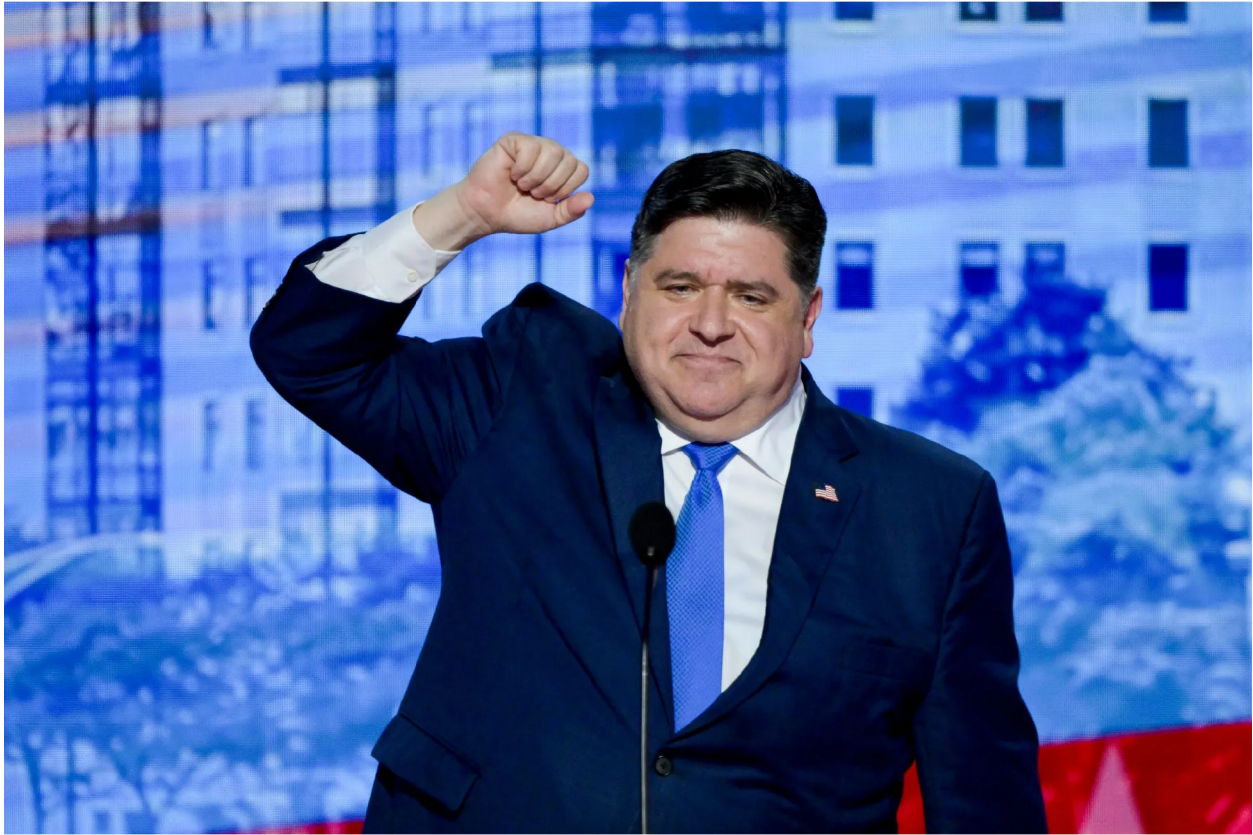
J.B. Pritzker during the Democratic National Convention in 2024.

At the annual Gridiron Club dinner in Washington on Saturday, Moore acknowledged his ambitions for higher office while making jokes that jabbed at Trump.