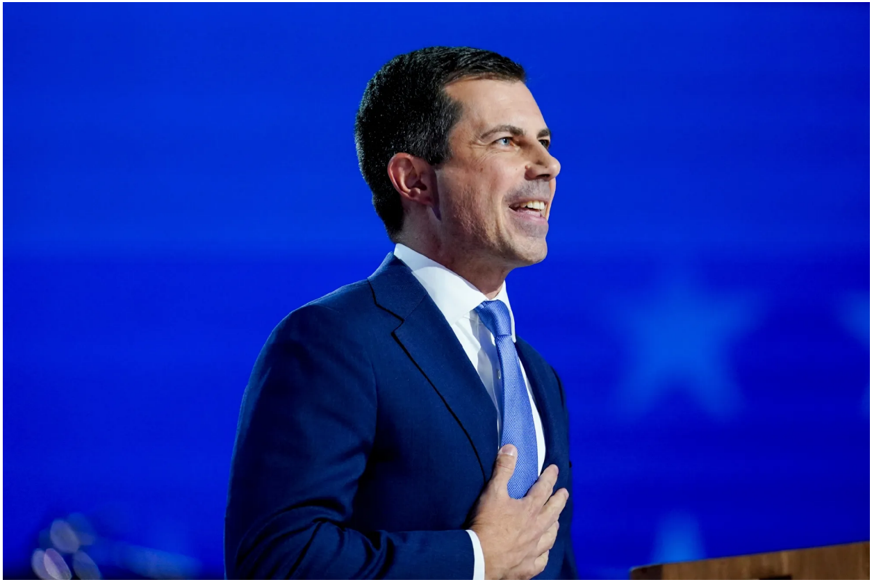
Pete Buttigieg

Former Transportation Secretary Pete Buttigieg said on Thursday that he won't run for statewide office in Michigan, and remains "intensely focused" on an alternative to Trump. His decision paves the way for a future White House run, according to a person familiar with his thinking.