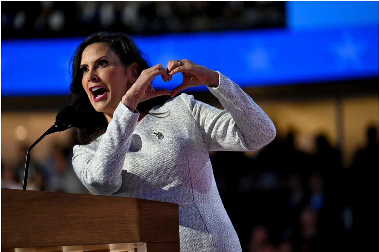
Gretchen Whitmer

Whitmer, the Michigan governor, met with Trump at the White House last week to discuss defense investments, environmental issues and tariffs. Michigan, home base of the US auto industry, is especially sensitive to Trump’s trade policies. Whitmer expressed gratitude for the meeting.