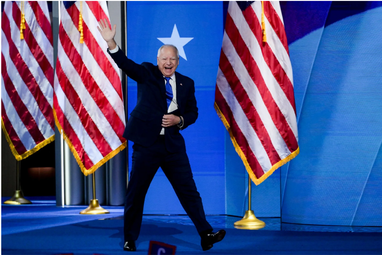
Tim Walz

Other Democrats are taking their pitch to Trump country in person. Minnesota Governor Tim Walz, Harris' running mate, visited House districts under Republican control in Iowa and Nebraska last week.