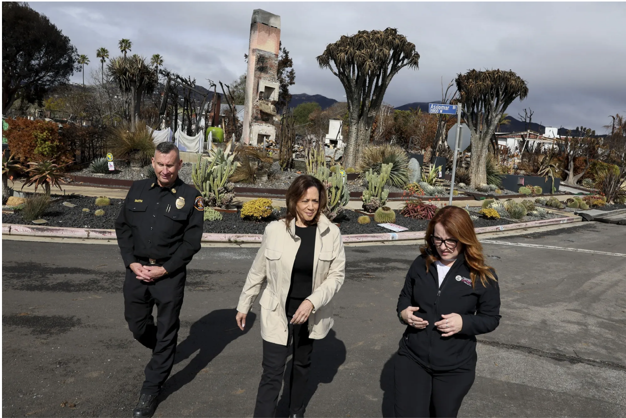
Kamala Harris tours a fire-damaged neighborhood with Los Angeles County officials.

Since her loss to Trump, Harris has mostly flown under the radar of national politics. She has made public appearances in her home state of California, where she hasn't ruled out a run for governor to replace Newsom, who is term-limited.