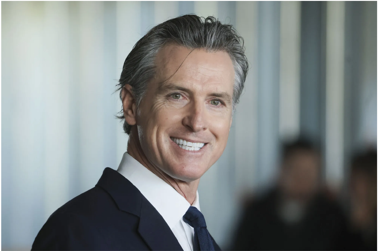
Gavin Newsom

In February, the California governor launched a podcast, This Is Gavin Newsom , that has had conservative influencer Charlie Kirk and former Trump adviser Steve Bannon as guests. Podcasts were widely credited with helping turn voters – especially young men – toward Trump.