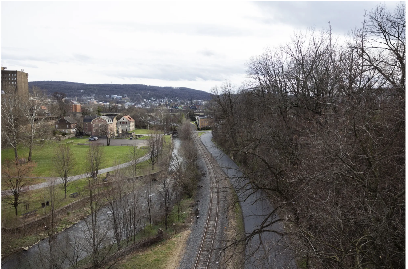
A view of Bethlehem, Pennsylvania.

"People need to really think about everything that's been done. You don't necessarily feel all of the advantages immediately," says Democratic Congresswoman Susan Wild, who represents parts of Northampton County and is up for re-election. "The last Congress and this president will be viewed very, very favorably in the long term in terms of what got done."