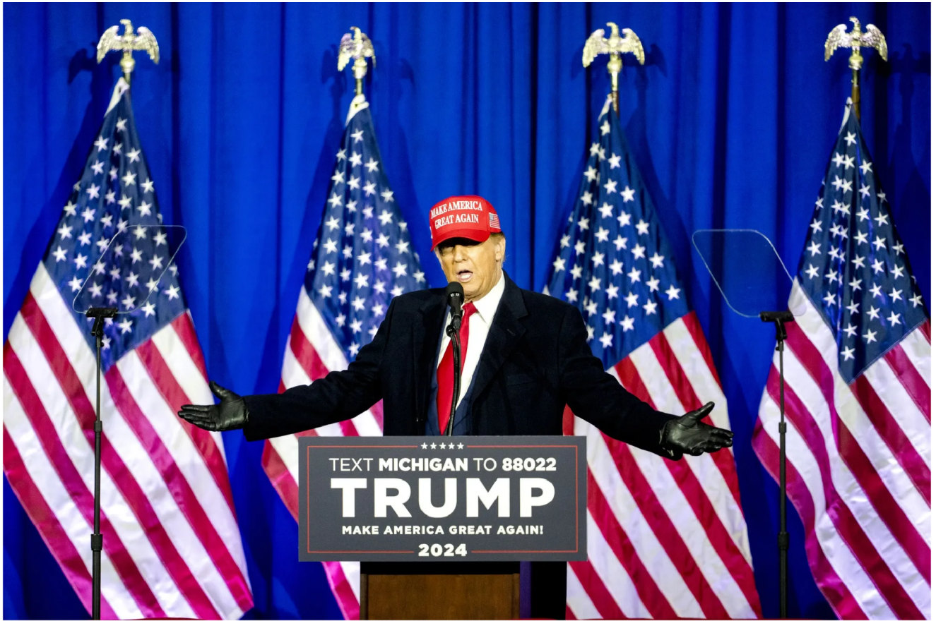
Former US President Donald Trump speaks during a 'Get Out The Vote' rally in Waterford Township, Michigan, on Feb. 17.

Despite that, as the White House seeks to engineer a modern manufacturing boom, federal investments have been more substantial elsewhere in the country. Pennsylvania has received tax breaks and funding worth $4 billion from Biden's agenda. Wisconsin has secured even less at $2 billion, while Michigan holds a substantial $22 billion, according to White House data .