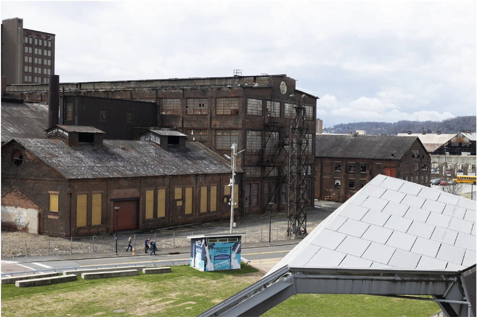
The shuttered Bethlehem Steel plant in Bethlehem, Pennsylvania.