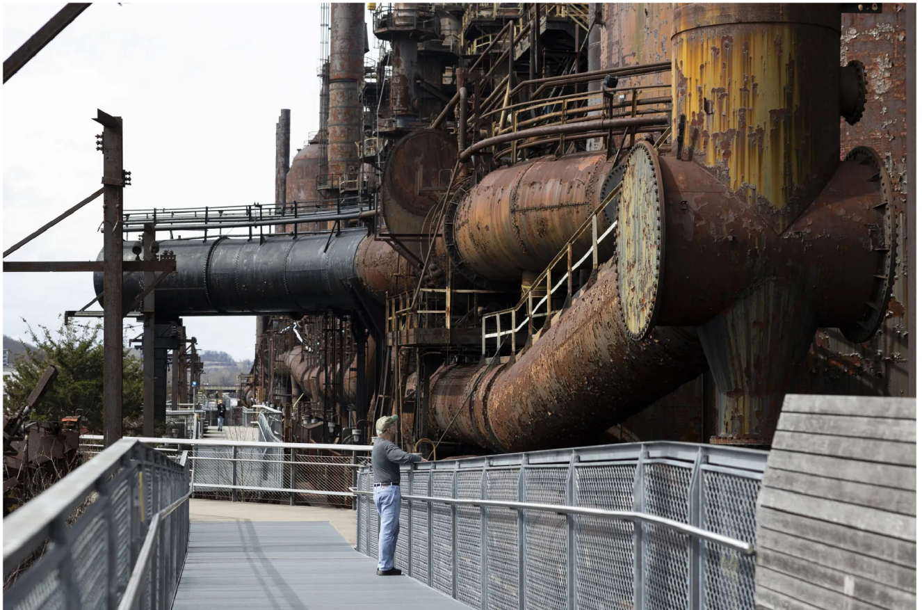
A pedestrian bridge allows visitors to get a closer look at the Bethlehem Steel Stacks in Bethlehem.

Business leaders and elected officials in Northampton County praise the stimulus from Biden's industrial measures as offering a once-in-a-lifetime opportunity of regeneration. Many voters, however, are preoccupied with the cost of living, and have yet to be convinced that Bidenomics, as the president's economic policy is known, is yielding much for them.