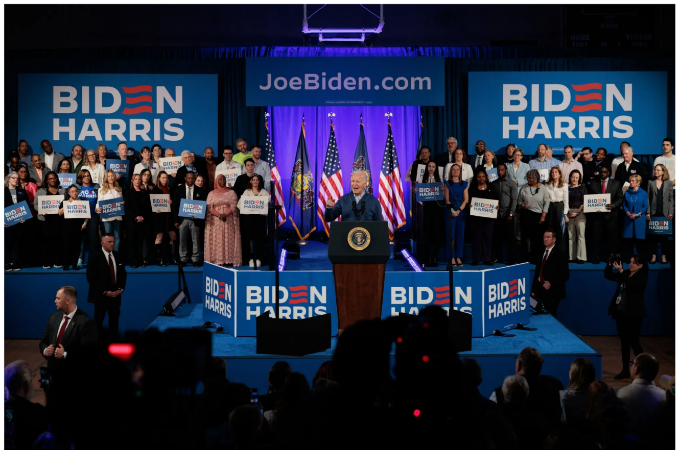
US President Joe Biden during a campaign event at Strath Haven Middle School in Wallingford, Pennsylvania, on March 8.

"A vote for Trump is a vote to keep those manufacturing jobs in America, and add a lot of jobs," the former president said last month in Michigan, another state steeped in the glories of the US industrial past.